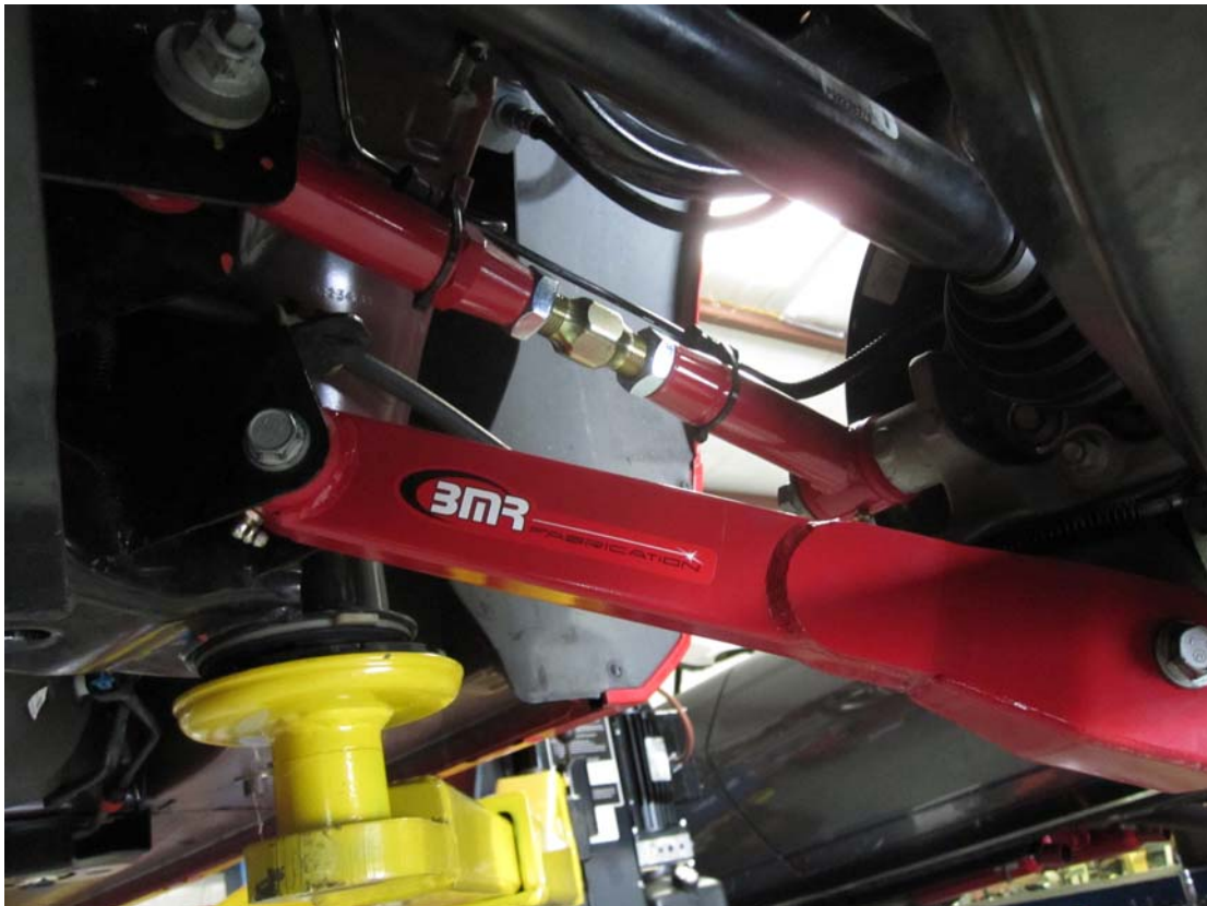
BMR Adjustable Toe Rod and Trailing Arm