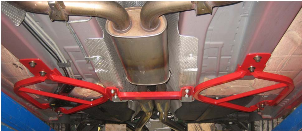
Above image shown with optional BMR subframe connectors installed.

This product is an aftermarket accessory and not designed by the vehicles manufacturer for use on this vehicle. As such, Buyer assumes all risk of any caused to the vehicle/person during installation or use of this product.