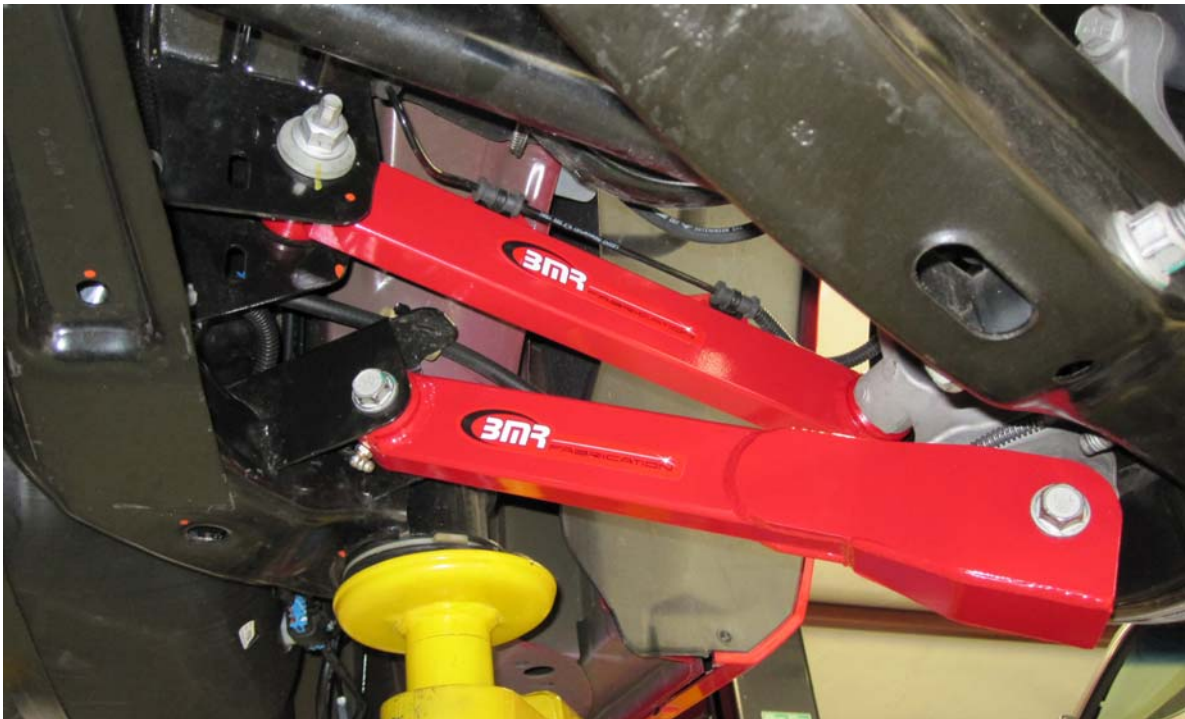
BMR Toe Rod and Trailing Arm